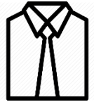
Product Being Viewed By The Customer